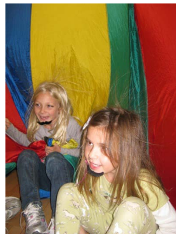
Hiding in the parachute during Mustache Mania Week!